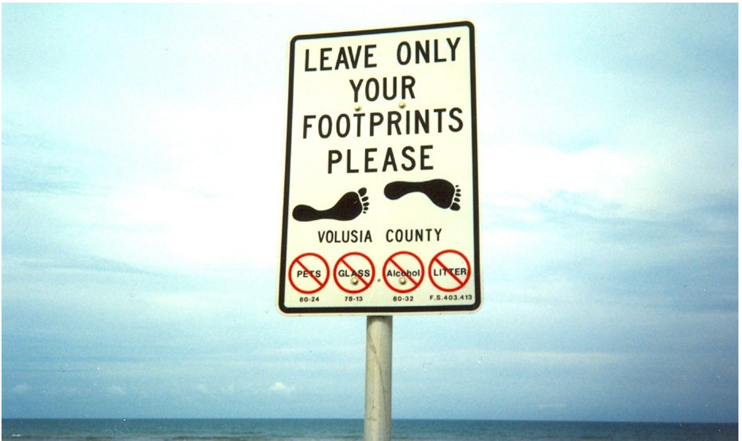
Beachside sign with the Atlantic in the background – Flagler Beach, Florida

We stopped a few times at souvenir shops, and we parked at a couple of pull-outs where you can walk down to the beach. I didn't go swimming or anything, but I did get some nice pictures of the Atlantic (mostly at a place called Flagler Beach).