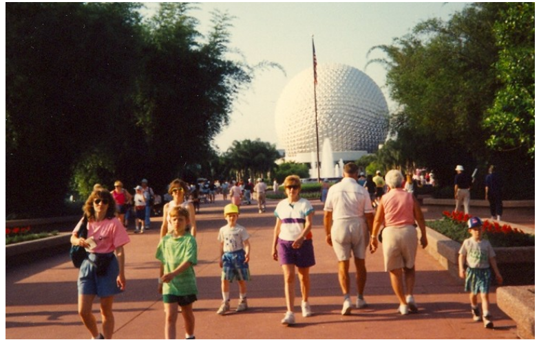
Spaceship Earth – Epcot Center

In the science area we saw pavilions entitled Energy, Horizons, Discovery, Wonders of Life, Imagination, Land, Motion, and Spaceship Earth (which is that big geodesic dome you see in all the pictures of Epcot). It sounds bad to say it, but they're all pretty much alike. The typical pavilion has a small museum area that gives superficial information about its topic. Then there's a high tech film show, and then there's the ride. Every building has some sort of train or boat that takes you on a journey through all the wonders it highlights. I'd never been to any sort of theme park before, so the rides were interesting. They are all pretty much alike, though. The most interesting ones were probably Imagination (where they highlighted inventors, authors, and artists), Spaceship Earth (where they gave you a roller-coaster ride through the history of communications), and Land (where a boat ride takes you through various environments of the earth and ends up at their experimental indoor farm, where they use hydroponics to grow vegetables for the Disney World restaurants. I could write paragraph after paragraph about the wonders of each particular pavilion (like I did after the world's fair), but you get the idea.