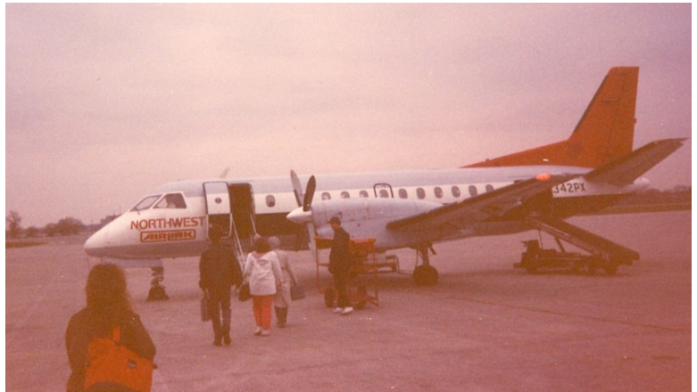
SF-340 bound for Mason City

The plane was surprisingly large. We flew on an SF-340—which has two seats, an aisle, and then one more seat in each row (lettered A, B, and F). To me, that would make the weight unbalanced, but the plane did seem to make it off the ground okay. We even had a flight attendant on this big plane. She served drinks and nuts, and she even had time to refill the drinks on the short hop down to Iowa. [The plane was “big” compared to the 19-seater I’d flown from Moline to Chicago on. It is the smallest plane in Northwest’s fleet, and no one is ever going to confuse it with a 747. For connecting minor airports to a hub, though, this 30-seat prop jet really works quite well. Northwest has since revised the schedule so that Sioux City passengers no longer need to make two stops to get to MSP. Mason City and Fort Dodge are still linked together, though. The two airports are equidistant from me, but it’s certainly easier to do a direct flight from Mason City than leaving from Fort Dodge and stopping en route.]